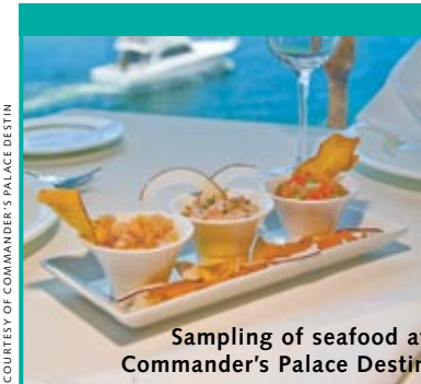
Sampling of seafood at Commander's Palace Destin

A structure that's nearly a century old and plenty of local memorabilia make this restaurant a throwback to old Florida. But modern diners will love the blend of fresh seafood and classic Italian. Try the Scallops St. Jacques, served with fettucine; or the veal marsala with pasta. 157 Brooks Street, Fort Walton Beach; 850-302-0266; www.magnoliagrillfwb.com